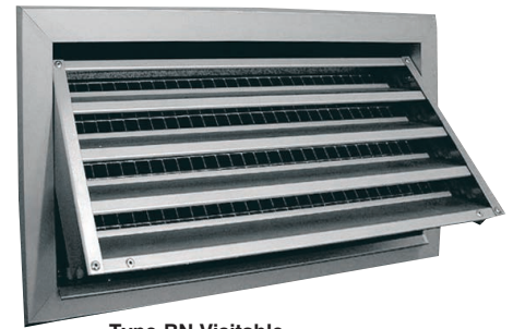
Type BN Visitable