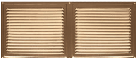
MXM 300 x 150