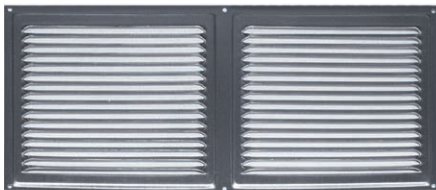
MXM 300 x 150