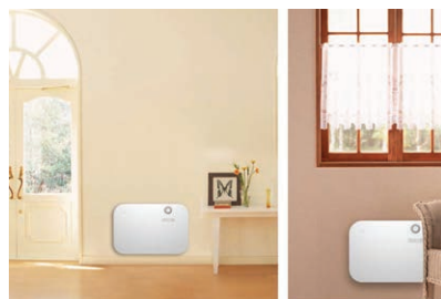
Easy to install, fits within any interior design.