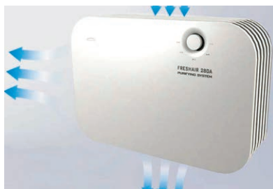
Three air outlets and one air intake guarantee deep-cleaning circulation.