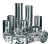
Stainless Steel Insulated Chimneys