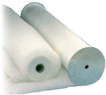
G3 - R 29