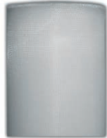
G3 - MK16 (nylon)